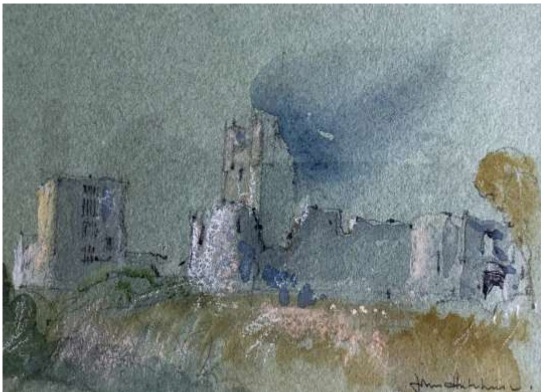
15. Untitled. Castle - Helmsley Castle? [ North Yorks.] Undated

Water colour mounted, framed and signed 150x110mm Frame size 340 x310mm [Ref: 20984] £250