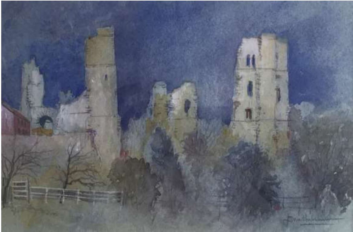
17. Untitled, [Sheriff Hutton Castle, North Yorks.] undated

Watercolour, mounted, framed and signed. Image size 235 x 160mm. Frame size 420 x 380mm [Ref: 20982] £295